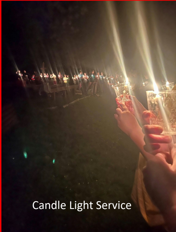
Candle Light Service