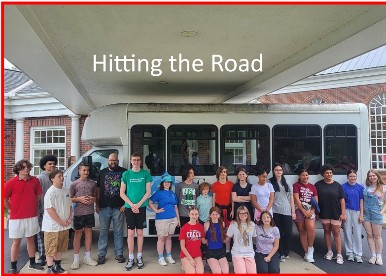
Hitting the Road