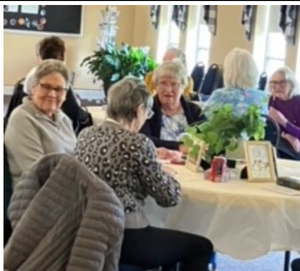
EPW Luncheon -April 3, 2024