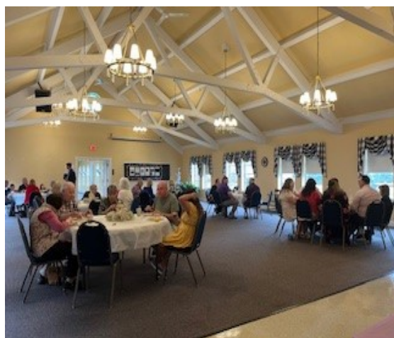
Sunrise Breakfast - April 1, 2024

There will be a Deacons' Service meeting on Thursday, April 11, 2024 at 11:00 a.m.