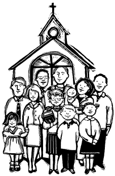
Our Church Family

The Outreach Committee has been tasked with updating our membership rolls in an effort to report accurately to the presbytery our membership. This effects what we pay per capita to the presbytery, plus we are better able to gauge the needs of our church when we report accurate numbers.