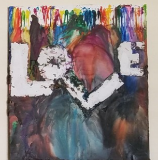
Middle School Artwork