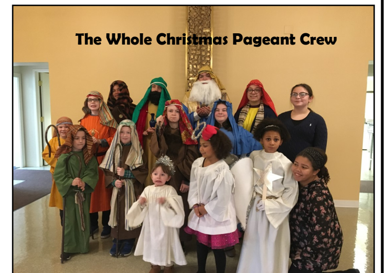
The Whole Christmas Pageant Crew