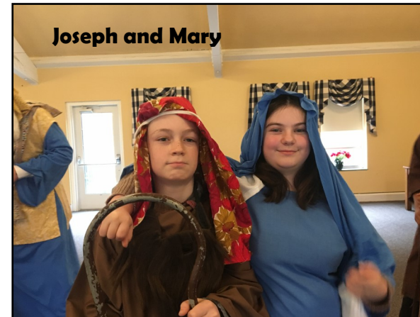
Joseph and Mary