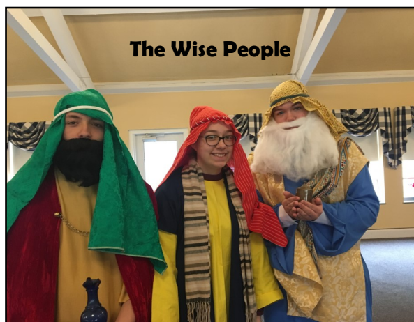
The Wise People