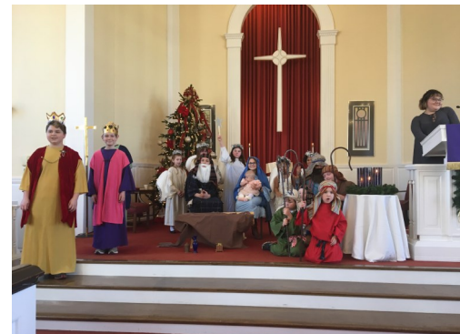
All children and youth

For unto you is born this day, in the city of David, a Savior, which is Christ the Lord. Luke 2:11