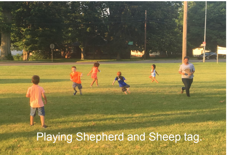
Playing Shepherd and Sheep tag.