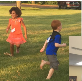
Having a great time at VBS!!