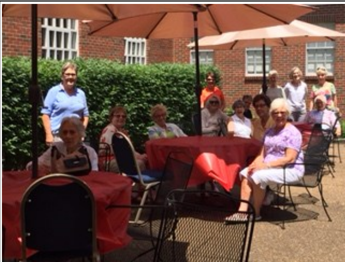
A fun time was had by all who attended the Annual EPW Picnic on Wednesday, June 7th!

Only a few dates remain open for helping with our Summer Christian Education opportunities. We have June 25, August 6 and August 20 open for teaching Children’s Sunday School, July 30, August 6, August 27 and September 3 open for Children’s Worship and June 25, July 16, 23, 30 and September 3 for Adult Sunday School. Call the church office to let us know which program(s) and date(s) you’d be willing and available to lead our children or adults.