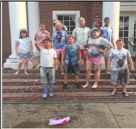
11 Middle Schoolers and High Schoolers enjoyed a Powder Sugar Party. This has been an annual event for several years now and the kids still love it!